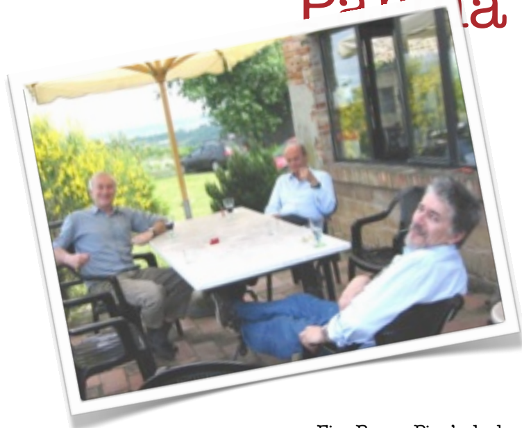
Fico Rosso, Pino's dacha.